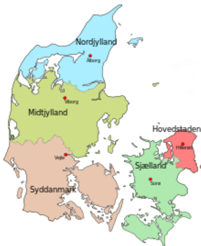
Figure 1 Supply Base

Haderup Skovservice's supply base is Danish forests, windbreaks, scenic areas and urban plantations where the supply base covers all of Denmark, however, mainly Mid-Jutland.